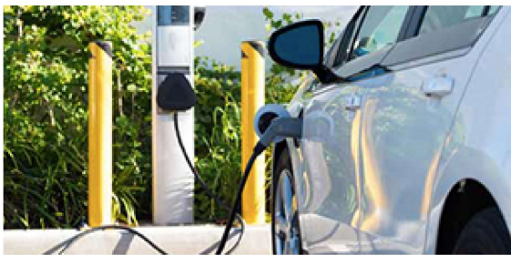
IBEW is continuing a national push to certify and train members to install EV charging infrastructure.

“EVITP has become such a gold standard in our industry that the Biden administration recently made it their preferred program for training the men and women who will be installing and maintaining thousands of EV charging systems across the United States over the next several years,” he said.