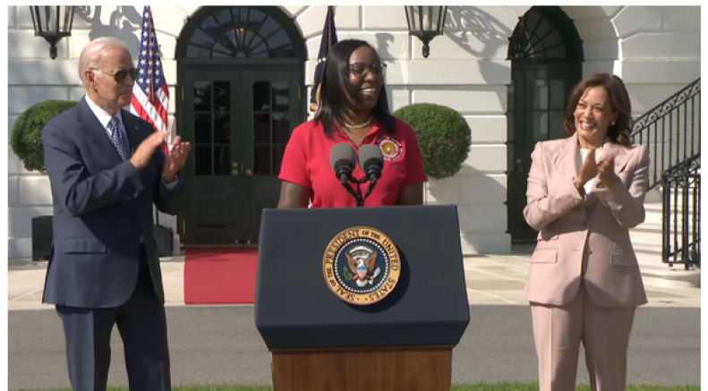
At a September celebration, Boston Local 103 fifth-year apprentice Lovette Jacobs introduces President Biden on the South Lawn of the White House.

Other incentives in the bill will boost traditional forms of energy generation that employ thousands of IBEW members, including nuclear and carbon capture on coal and gas power plants, along with a new tax credit for developing solar and wind energy components.