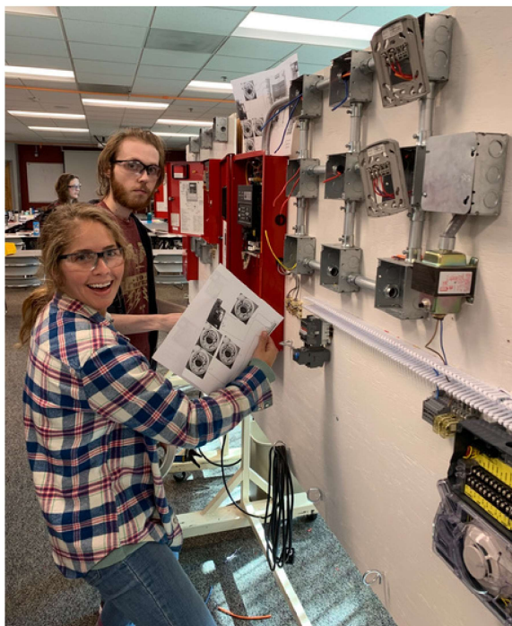
A new U.S. Department of Labor initiative is widely promoting the use of registered apprenticeship programs like Portland, Ore. Local 48's.

Labor-management partnerships between local unions and their respective National Electrical Contractors Association chapters are among 200 entities chosen to share their experiences and collaborate with the DOL to champion apprenticeship opportunities.