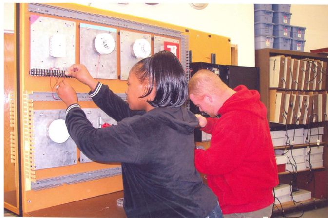
IBEW members strongly support high quality registered apprenticeship programs, the gold standard in the electrical construction industry.

"A skilled workforce is foundational to a strong economy, and RAPs provide a proven avenue by which to deliver much-needed talent development to various industry sectors," the DOL rule said. "For over 80 years, the Registered Apprenticeship system has been successful in providing the industry with high-quality work-based learning."